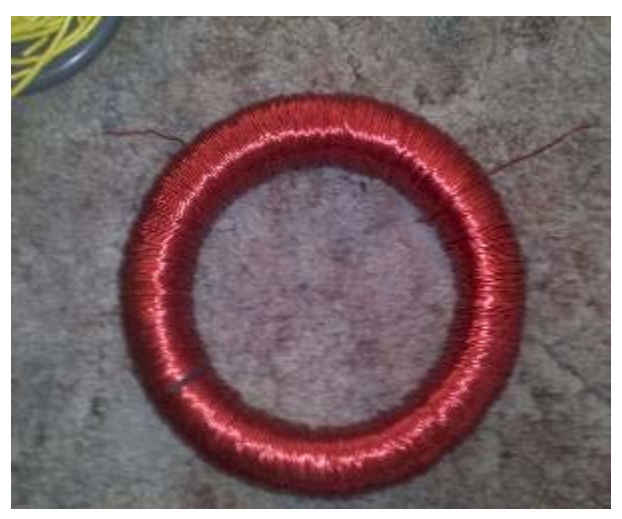
Original Two Toroid Gabriel wound coil