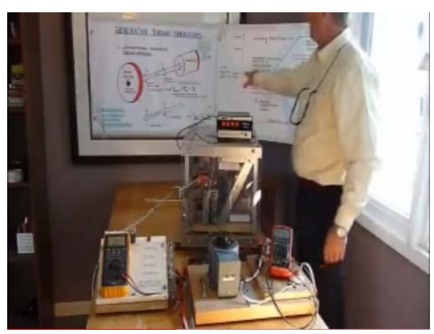
Thane explaining his commercial regenerative technology

This "type" of NEW DISCOVERY is capable of causing a paradigm shift in both the engineering and business worlds. However Interference and stagnation occurs because there is no supporting theory, ALL new discoveries in energy production cannot have a supporting theory in the first phase. Additionally not all devices have suffered from business incompetence, inventor paranoia and suppression by vested interests, but ALL of them CONTINUE to suffer by having no previous supporting theory to explain their new energy discovery. As a result academia and others will then cause Interference; this is present in ALL the past and suppressed free energy devices mentioned on the Panacea site.